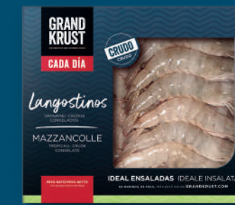
HOSO RAW VANAMMEI SHRIMP LANGOSTINO VANAMMEI CRUDO · CONGELADO 400g-700g | F 400g: 12/16, 16/20, 20/24 700g: 7/14, 14/21, 21/28, 28/42, 42/56