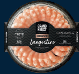
COOKED PRAWNS RING CORONA DE LANGOSTINOS COCIDO · CONGELADO 290g | F