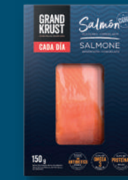
COHO SALMON SALMÓN COHO PLATEADO · CRUDO · CONGELADO 150g | F