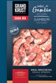
P&D RAW ARGENTINE RED SHRIMP COLAS DE GAMBÓN AUSTRAL PELADO · CRUDO · CONGELADO 200g | W TALLA / SIZE: 20/40