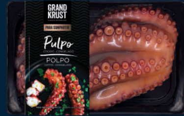
WHOLE / HALF COOKED OCTOPUS PULPO COCIDO ENTERO / MEDIO · CONGELADO 300g-600g | W