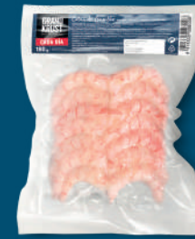
P&D RAW ARGENTINE RED SHRIMP COLAS DE GAMBÓN AUSTRAL PELADO · CRUDO · CONGELADO 180g | W TALLA / SIZE: 20/40