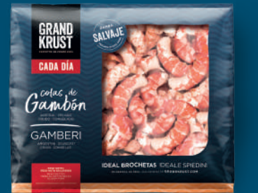
P&D RAW ARGENTINE RED SHRIMP COLAS DE GAMBÓN AUSTRAL PELADO · CRUDO · CONGELADO 400g | W TALLA / SIZE: 20/40