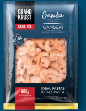
PUD RED SHRIMP GAMBA SALVAJE PELADA · CRUDA · CONGELADA 600g | W TALLA / SIZE: 88/123, 53/88