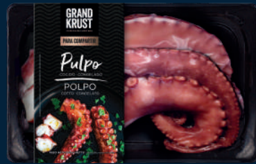
COOKED OCTOPUS TENTACLES PULPO COCIDO 1/3 REJOS · CONGELADO 250g | W