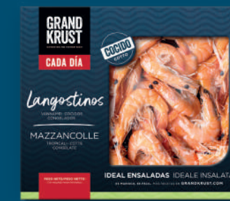
HOSO COOKED VANAMMEI SHRIMP LANGOSTINO VANAMMEI COCIDO · CONGELADO 400g-700g | F 400g: 12/16, 16/20, 20/24 700g: 7/14, 14/21, 21/28, 28/42, 42/56