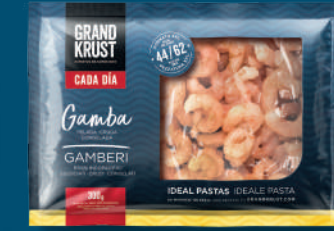
PUD RED SHRIMP GAMBA SALVAJE PELADA · CRUDA · CONGELADA 300g | W TALLA / SIZE: 44/62, 62/88