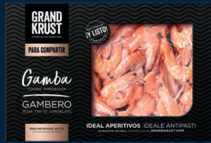
COOKED DEEPWATER PINK SHRIMP GAMBA COCIDA · CONGELADA 1kg | W TALLA / SIZE: 80/100, 100/120, 120/140