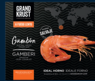
HOSO RAW ARGENTINE RED SHRIMP GAMBÓN AUSTRAL CRUDO · CONGELADO 1kg | W TALLA / SIZE: 10/20, 20/30, 30/40