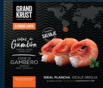
HLSO RAW ARGENTINE RED SHRIMP COLAS DE GAMBÓN AUSTRAL CRUDO · CONGELADO 1kg | W TALLA / SIZE: C1, C2