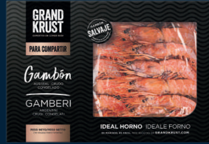
HOSO RAW ARGENTINE RED SHRIMP GAMBÓN AUSTRAL CRUDO · CONGELADO 2kg | F TALLA / SIZE: 10/20, 20/30, 30/40