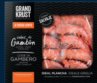
HLSO RAW ARGENTINE RED SHRIMP COLAS DE GAMBÓN AUSTRAL CRUDO · CONGELADO 400g-700g-800g | W TALLA / SIZE: C1, C2