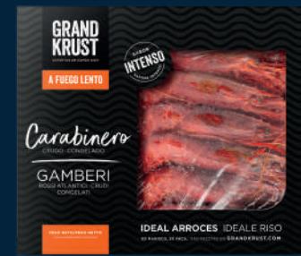
HOSO SCARLET SHRIMP CARABINERO CONGELADO 400g | W TALLA / SIZE: 4/8, 8/12