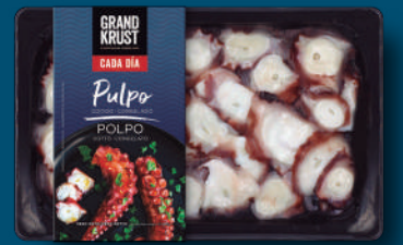
COOKED SLICES OCTOPUS PULPO COCIDO TROCEADO · CONGELADO 250g | W