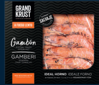
HOSO RAW ARGENTINE RED SHRIMP GAMBÓN AUSTRAL CRUDO · CONGELADO 400g-700g-800g | W 400g: 4/8, 8/12, 16/24 700g: 7/14, 14/21, 21/28 800g: 8/16, 16/24, 24/32