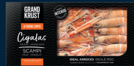
CRAYFISH CIGALAS CONGELADAS 400g-700g-800g | W 400g: 13/19 700g: 17/20 800g: 16/24