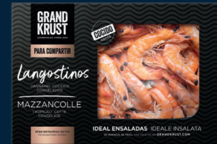
HOSO COOKED VANNAMEI SHRIMP LANGOSTINO COCIDO · CONGELADO 2kg | F TALLA / SIZE: 20/30, 30/40, 40/60, 60/80, 80/100