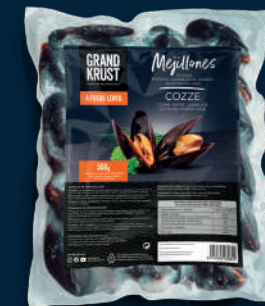
MUSSELS MEJILLONES CONGELADOS 500g | F